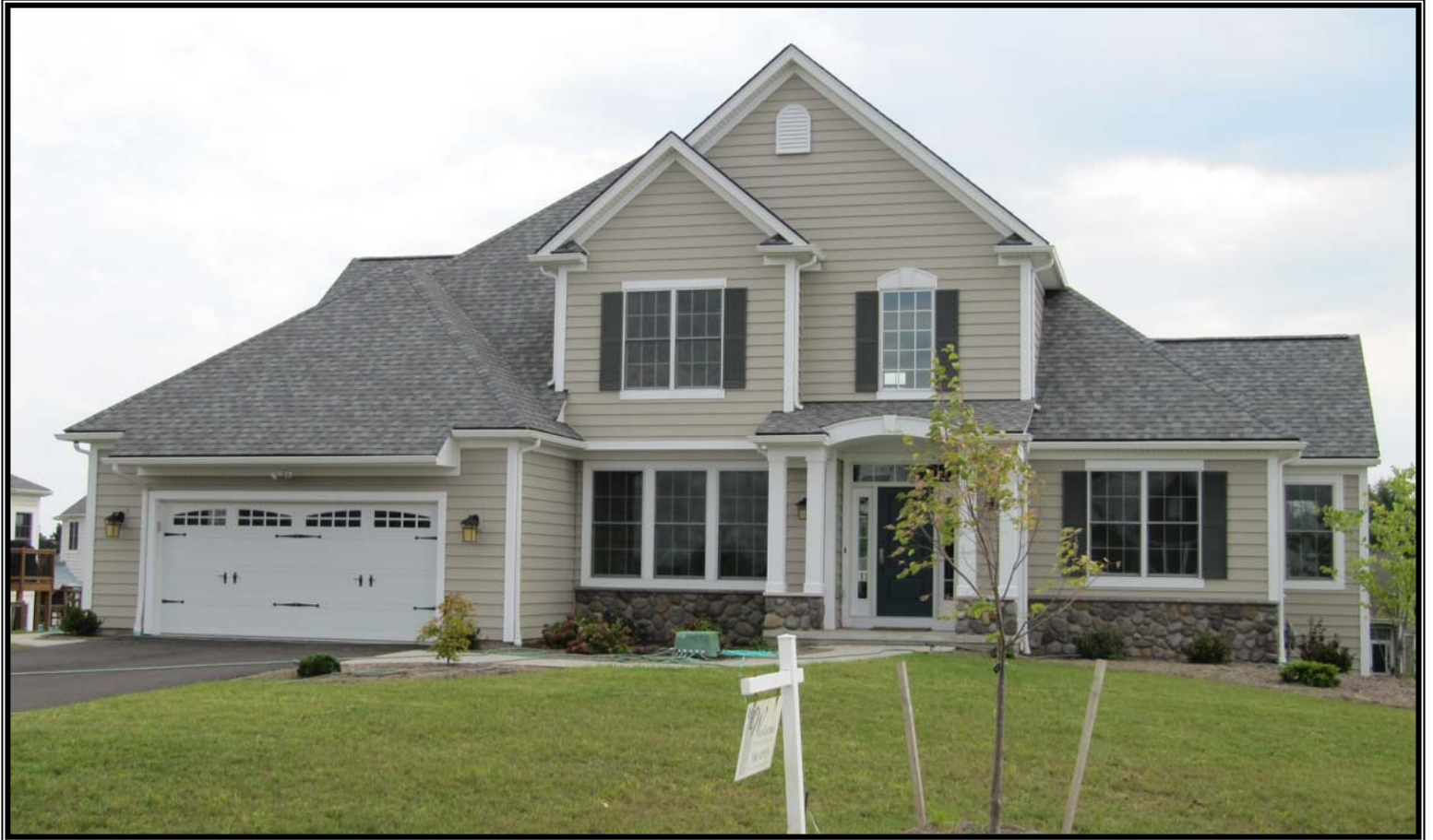
Lot 338 Autumn Woods - Pittsford, NY