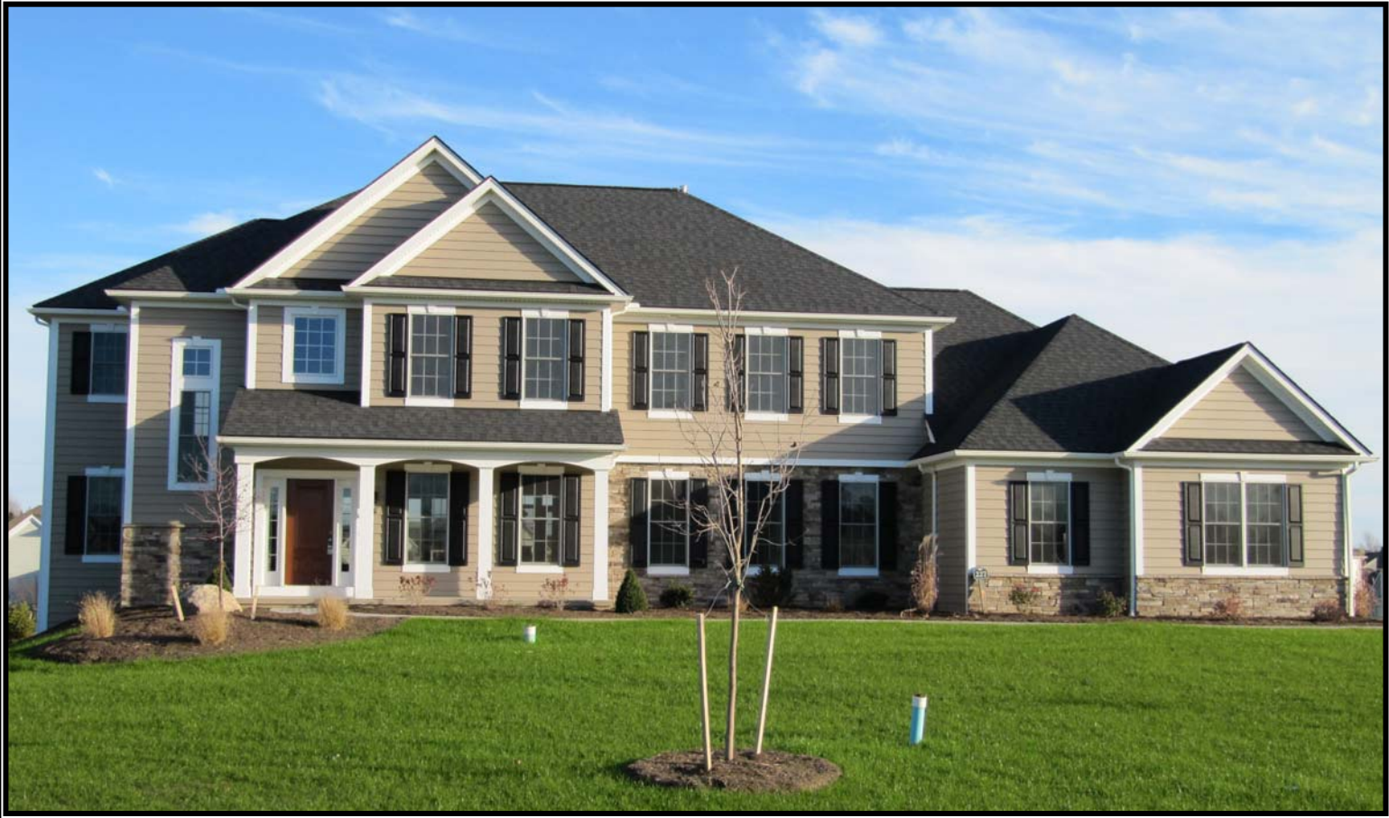
Lot 227 Autumn Woods - Pittsford, NY